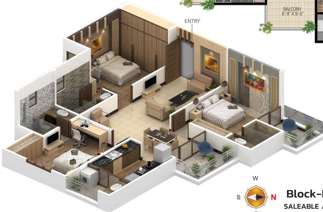
Block-B | 3 BHK-01 SALEABLE AREA | 1580 Sq.Ft.