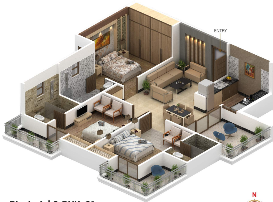
Block-A | 3 BHK-01 SALEABLE AREA | 1652 Sq.Ft.