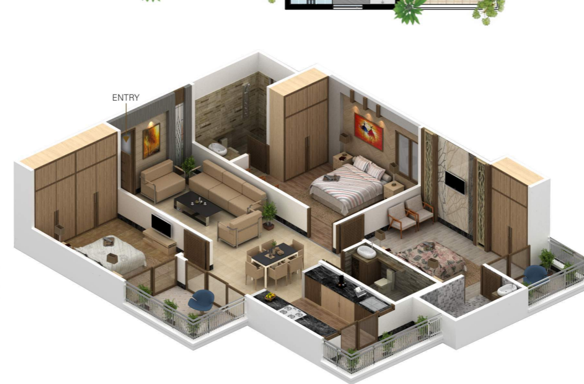
Block-A | 3 BHK-05 SALEABLE AREA | 1550 Sq.Ft.