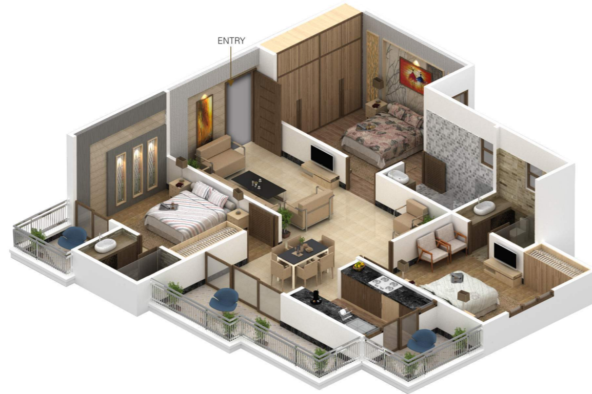
Block-A | 3 BHK-04 SALEABLE AREA | 1603 Sq.Ft.