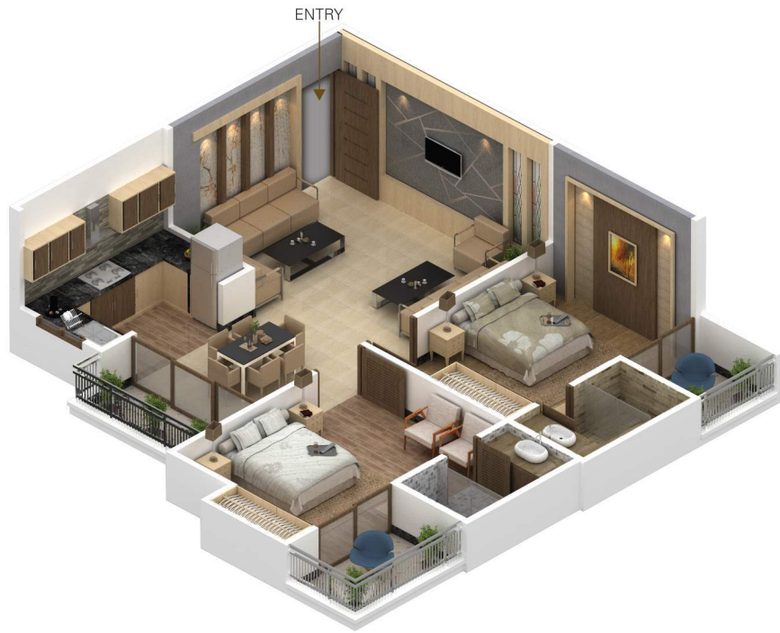
Block-B | 2 BHK-16 SALEABLE AREA | 1205 Sq.Ft.