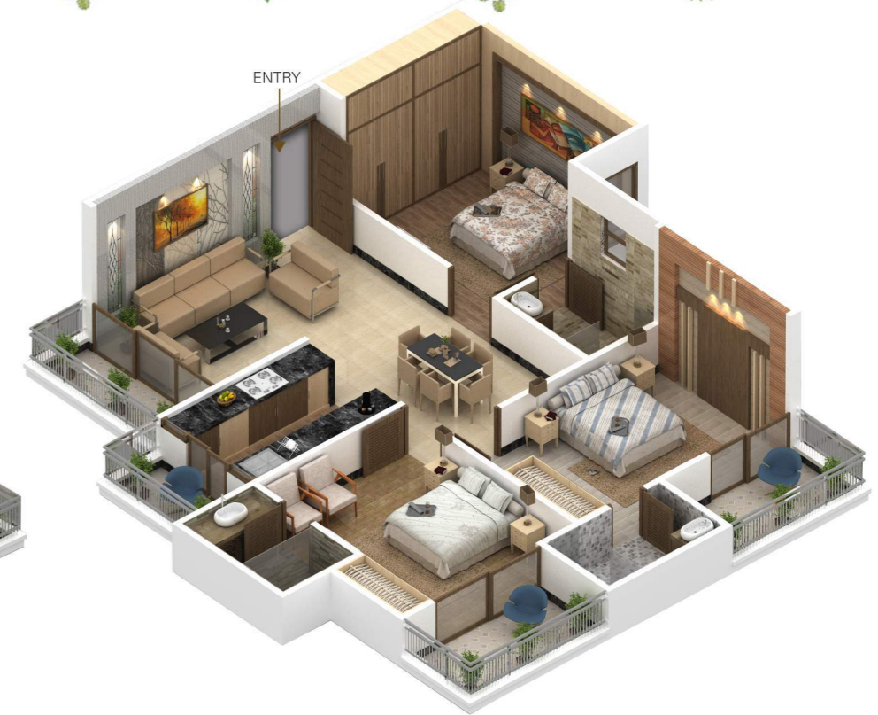
Block-A | 3 BHK-10 SALEABLE AREA | 1560 Sq.Ft.