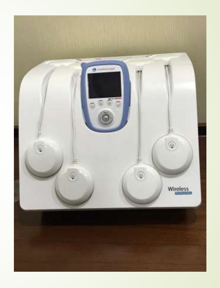
Wireless muscle stimulators