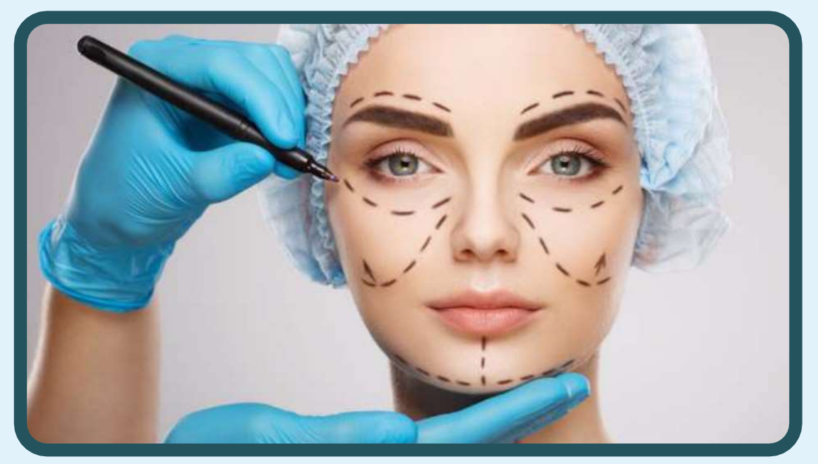
Plastic Surgery: All type of cosmetics and traumatic surgery.

The 10 bedded ICU has continuous supply of oxygen, continuous monitoring of consultants and nursing staff etc.